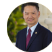
Tri Ta author (R - 70)