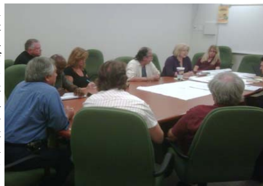
A meeting in the Humanities & Social Sciences Division.

This first hurdle of meaning-making was the largest of the several we have had to address as a division. Our successful "leap" over it was facilitated by several activities that worked together to create a dynamic dialogue among the faculty: (1) workshops and hours of individualized assistance by the Research and Institutional Effectiveness Office staff with faculty and division deans; (2) permanent agenda space for SLO discussion at division meetings; and (3) a division macro-management process providing support but encouraging departmental-level exploration and dialogue. The single most important element in this part of the process has been the recognition of measurable objectives as foundations for SLOs. When that recognition occurred, our development of meaning was ensured.