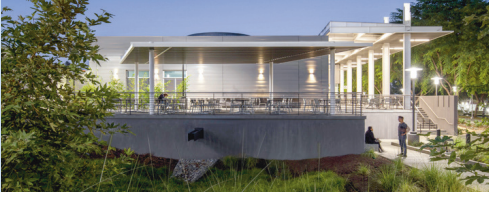
Mountie Café, Bldg. 8