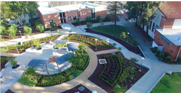
Rose Garden between the Administration Building and Learning Technology Center