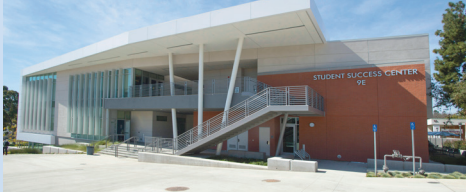
Student Success Center, Bldg. 9E