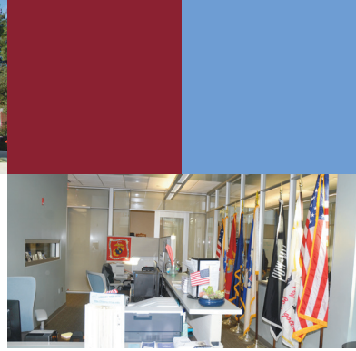
Veterans Resource Center