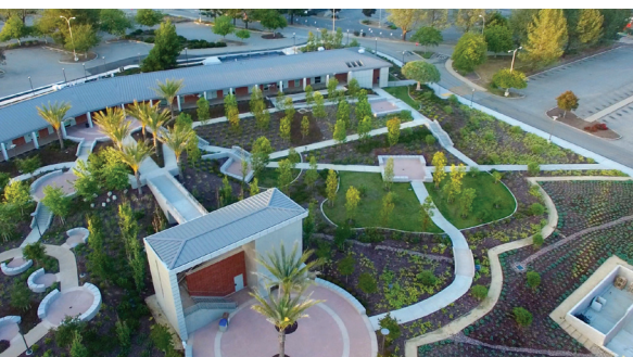
Building 12 landscaping