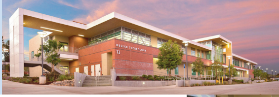
Design Technology Center, Bldg. 13