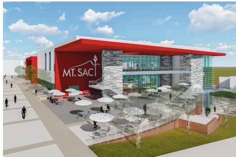
Rendering of Student Center