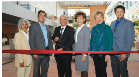
Business & Computer Technology Complex ribbon-cutting ceremony

Math/Science Complex & Exploratorium: $25.5M