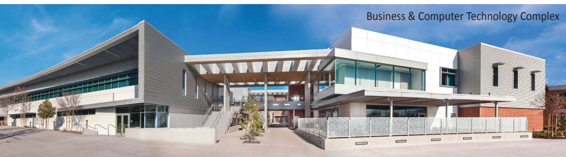
Business & Computer Technology Complex