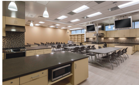
New Culinary Arts Kitchen/Classroom in Bldg. 78