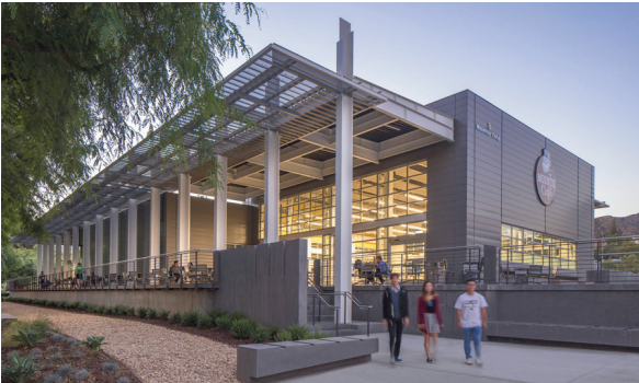
Mountie Café and dining area

From the beginning, we have been committed to providing students with quality facilities, current technology and an aesthetically pleasing campus environment that fosters innovative instruction and learning well into the 21st century.