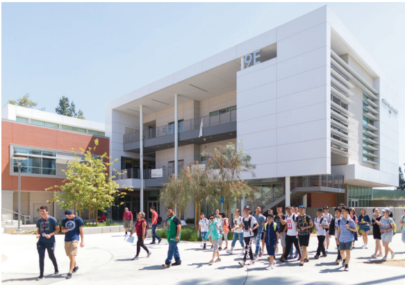
Student Success Center and study room